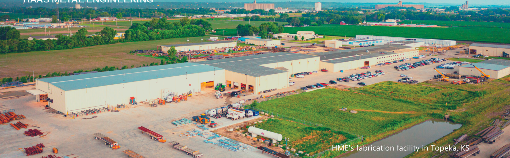
HME's fabrication facility in Topeka, KS